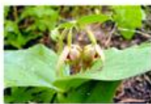
MAY Clustered Ladyslipper