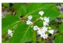
SEPT Spreading Dogbane