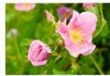
AUG Pearhip Rose