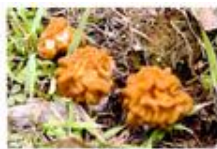
FEB Snow Mushroom