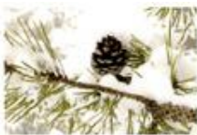
JAN Lodgepole Pine

One of the best things about year end is the arrival of our calendars, and this year we have again a small magnetic calendar for your frig, file cabinet, etc. The standard 8.5 by 11-inch calendar sells for $8 for the first, and $7 for each additional calendar. The small, 4.25 by 5.5 inch magnetic calendar is only $5. You can order ahead by calling Marilyn George at 263-9470 or mail an order to the chapter address at P.O. Box 1092, Sandpoint, ID 83864. Be sure to add $2 for S&H for the first calendar and $1 for each additional. If you place your order before the November meeting, you can pick up your calendars at the November meeting or at the December holiday gathering and not have to pay postage.