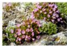
JUNE Rocky Mt Primrose