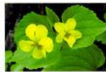
APRIL Pioneer Violet