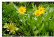
JULY Mule's Ears